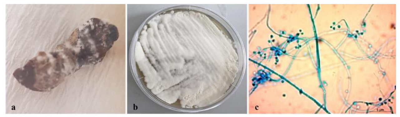
Figure 1. Macroscopy and microscopy of Beauveria bassiana HS1 strain. a) A larval cadaver showing mycosis naturally infected by the new strain. b) Macroscopic image of the HS1 strain on CAF. c) Mycelial and spore structures of the HS1 strain.

Fungi were isolated from the larval cadavers of the Hatay yellow strain brought to the laboratory. Based on the morphological images of the isolated fungal isolates on agar plates, one of the strains (HS1) was determined to be a new entomopathogenic fungal isolate. The isolate was morphologically defined according to conidia shape, conidia size, colony morphology and color, and symptoms in cadavers (Figure 1).