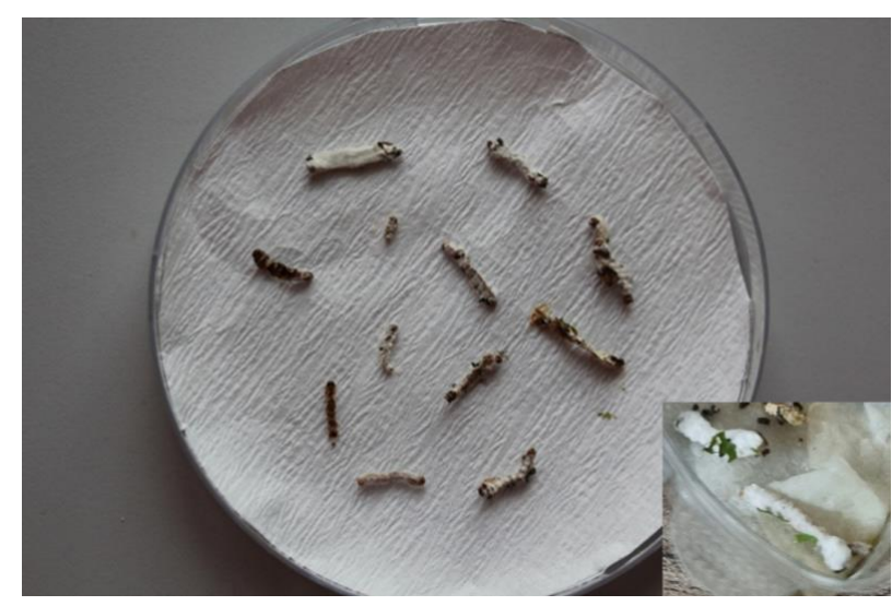
Figure 4. Mycoses cadavers (Hatay yellow silkworm) at the end of the infection.

N: number of individuals; SE: Standard Error; df: degrees of freedom; \chi^2 : chi-squared test; CI: confidential limits.