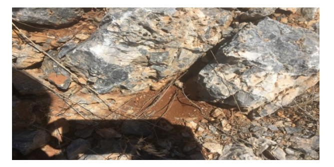
Figure 2. Different soil substrate in survey areas