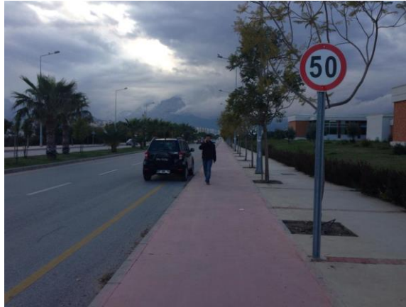
Figure 1. Traffic sign indicating the speed limit for the D section.

speed enforcement system is applied and its physical characteristics have been given in Table 1.