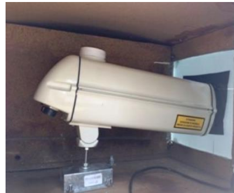
Figure 5. Average speed camera installed on the vehicle.