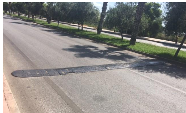
Figure 4. Speed bump appearance.