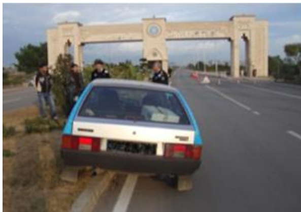
Figure 2. An example for accidents in the campus due to speeding.

In addition, according to studies carried out at the University Security Department, the number of ‘recorded’ accidents is around 10 per year. The highest number of accidents have occurred on section D at the University. Figure 2 shows an accident due to speeding on section D. The high number of accidents that takes place annually in an education campus leads us to consider whether the current speed bumps on the campus sections are effective or not. Indeed, increasing the number of speed bumps is not the best solution.