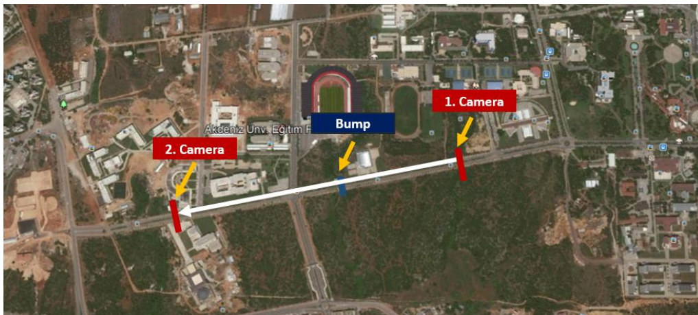
Figure 6. D section inside the campus.

Measurements were carried out on the 50 km/h speed limit D-section first with speed bumps for 5 days after which the speed bumps were removed temporarily and measurements were carried out without the speed bump for 3 days (the university administration allowed the removal of the speed bumps for only 3 days). The license plates of the vehicles were scanned via cameras and their average speed values were calculated.